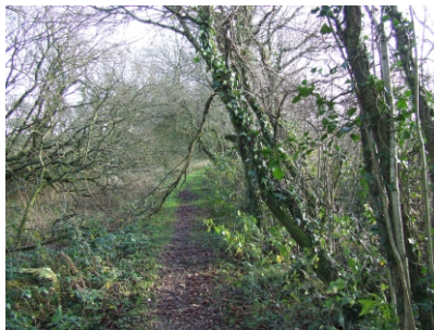
More branch damage

Into 2016, a dry day on the 6 th January and a change of location back to Virworthy Filter Beds found a similar wind damage situation requiring removal of some smaller trees. This was followed by general tidying up and burning of brash. Has anyone else noticed the natural resident stag sculpture lurking in the bushes just off the footpath?