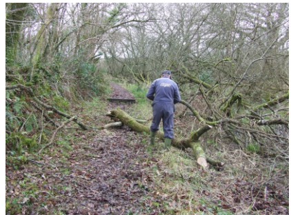
Cutting up fallen branches

Although the canal profile offers a convenient walkway round past the picnic table and benches at the Filter Bed the line of the original towpath on top of the bank was reopened up to offer a choice of direction to follow.