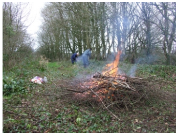
Burning of brash

As with many of the bridges, the visible section either side of Dexbeer roadbridge tends to get heavily overgrown and silted up, some clearance work was started here but more is needed within the limits of hands on rather than with mechanical assistance. Unfortunately the lead-in walls were not rebuilt during the conversion from a working tub boat bridge to the current design and these are now in a very poor state or have totally disappeared. Among the first signs of spring with the snowdrops emerging, work has now been completed on the repair / rebuild of the stonework at Gadlock ( Cradlock) bridge with others that are also in need of some TLC now in the pipeline.