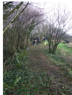
Last stump removal