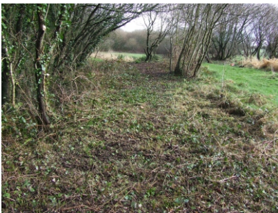
Original towpath line

Although the canal profile offers a convenient walkway round past the picnic table and benches at the Filter Bed the line of the original towpath on top of the bank was reopened up to offer a choice of direction to follow.