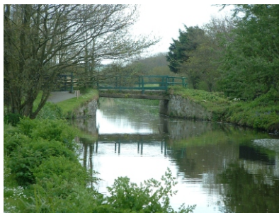
Rodds Bridge in 2002

This is earmarked to be used towards the replacement of Rodds Bridge to allow navigation to take place on the whole of the watered section between Bude and Helebridge. So, if you purchased Raffle tickets sent with your hard copy newsletter during mid 2015, thank you very much. The Trustees have agreed to partake in the 2016 Raffle which I hope you will be able to support.